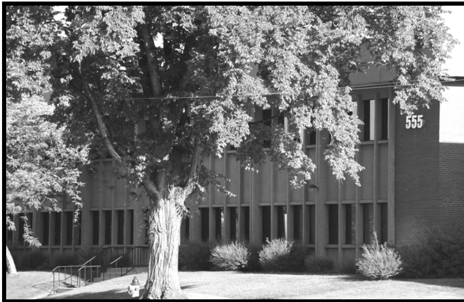
Front view of City Academy's new location at 555 East 200 South in Salt Lake City.

City Academy's new downtown campus is slated