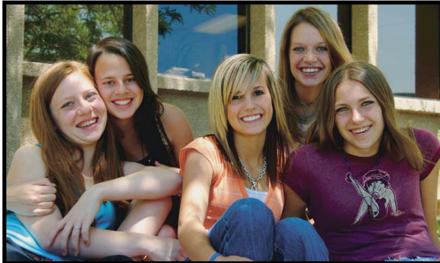
City Academy Students Outside School Building, June 2007

courses and City Academy’s distinctive approaches to learning. “Cambridge Advanced courses demand higher levels of analytical thinking and provide a better balance between breadth and depth of study than Advanced Placement (AP) courses.” Gareth also observes that