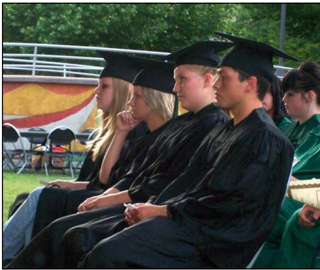
The graduating class of 2007 listens to speakers at commencement exercises held at the Gallivan Center.