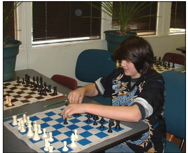
Student reviews his chess strategy in preparation for an upcoming match.